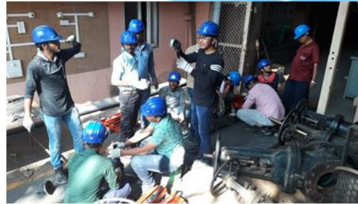
Mechanical Students at TPSDI for Maintenance Training