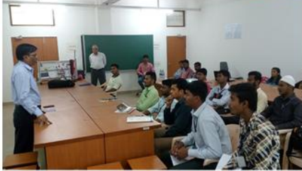
PLC Training Program at Instrumentation Dept