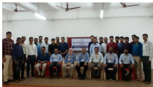
Group Photo with Principal, TPO, HoDs, Faculties with Alumini Alumini Association – Executive Committee