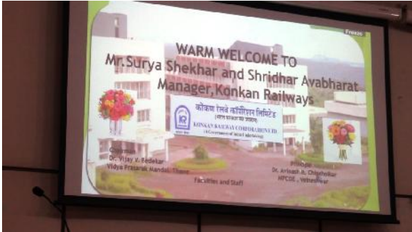
Welcome to Konkan Railways