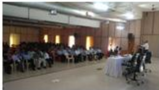
TPSDI Executives at MPCOE