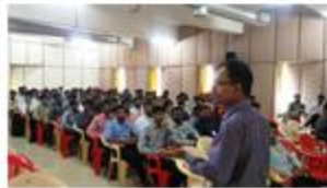
Konkan Railways Executives at MPCOE