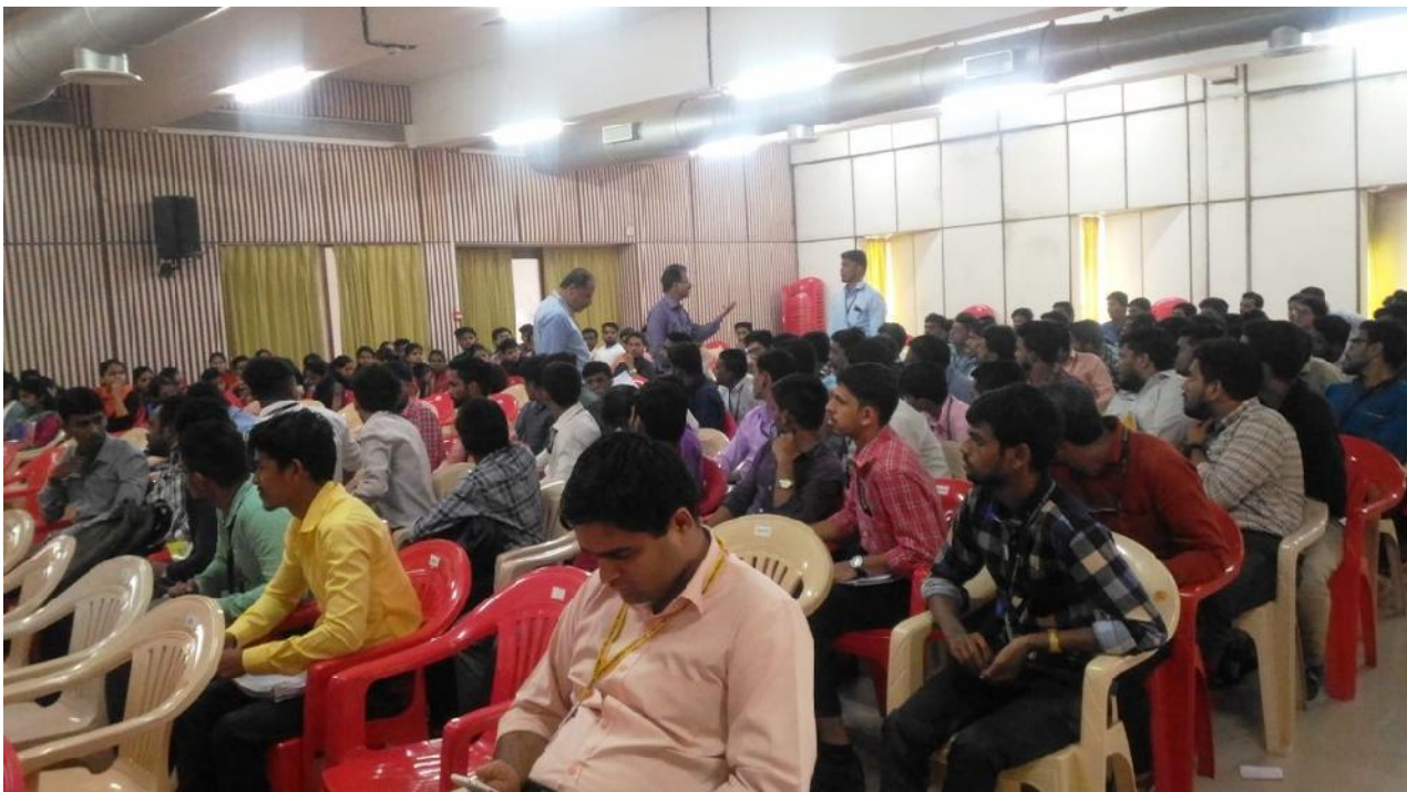
Konkan Railways Trainers interacting with MPCOE Students --