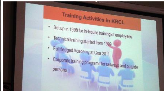
Training Facility of Konkan Railways (KRCL)