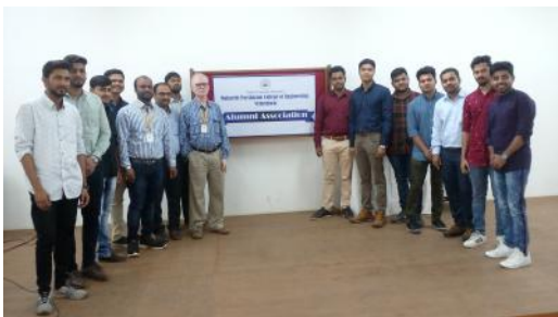
Alumini Association – Executive Committee